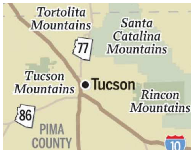
Figure 3.2: Mountain ranges near Tucson, Arizona.

the northeast, the Tortolitas to the northwest, and the Tucson Mountains to the west (see Figure 3.2). It's tempting to assume that this current geologic arrangement was formed from the collapse of an ancient and massive volcano's caldera, with the current mountain ranges being the uncollapsed edges of the volcano. 6