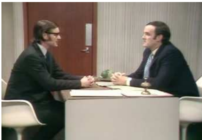
Figure 3.1: Michael Palin, left, argues arguments with John Cleese in Monty Python’s “Argument Clinic” sketch.

more involved. This chapter introduces common argument structures and shows how logical equivalences can be combined with rules of logical inference to create complex arguments, our final stop on the road to proofs.